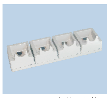
4 slot transceiver/charger